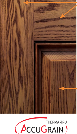
Both Classic-Craft and Fiber-Classic are rated a Consumers Digest Best Buy in the fiberglass entry doors category.

The look of real wood. Realistic wood grains that are virtually indistinguishable from high-grade wood doors, thanks to Therma-Tru's AccuGrain. technology.