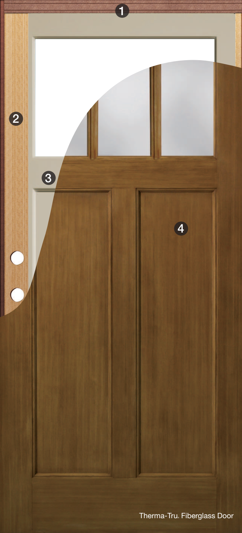
Therma-Tru. Fiberglass Door