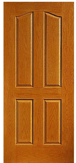
Fiber-Classic® Fire-Rated Door

Therma-Tru currently offers 20-minute positive pressure fiberglass fire doors, and is in development of fully qualified 45- and 90-minute positive pressure fiberglass fire doors.