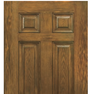
Standard Fiberglass Door

*Comparison of Classic-Craft to other standard fiberglass doors with similar styles. Visit www.thermatru.com for details.