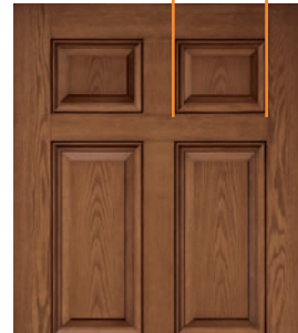
Classic-Craft Premium Door